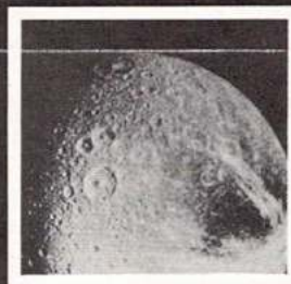
Dione, a satellite of Saturn