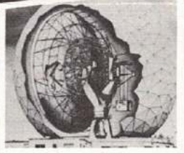
Haystack Radio Telescope