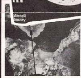
The Great Rift Valley from Gemini II